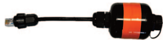
Inline Adapter for MOXA AP DT5905SA