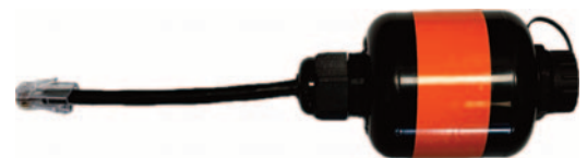
Inline Adapter for Cameras DT5904SA

"These connectors are built to last, and any failures we see are usually due to field handling rather than design. When needed, we simply replace them, and we're back up and running. Their integration with our plug-and-play system has been a game changer—it takes the complexity out of the equation. The final connection is crucial to getting our system running, and with this setup, our workers get the job done without relying on technical staff."